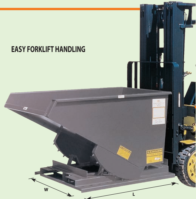
FOR GRAY ENAMEL FINISH, ADD SUFFIX "-G" TO MODEL NO.