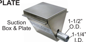
Suction Box & Plate

FOR USE WITH VENTURI LOADERS Stainless Steel Suction Box conveys material out of Material Storage Bins. Requires cutting or drilling by customer. Part No. 200206 ..... $235.00 ea.